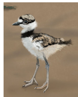
Killdeer youngster "so sweet"

Go to http://www.allaboutbirds.org/guide/Killdeer/sounds to hear their call. I promise, once you familiarize yourself with their call, you will always be able to find Killdeer.