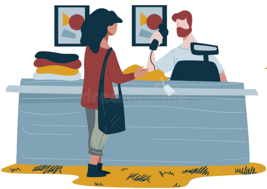
Shop in Store

In Store or on the Seed Truck, social distancing is encouraged.