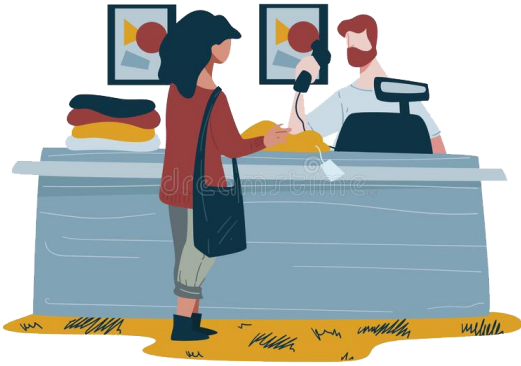
Shop in Store

10:00am to 5:00pm Monday through Saturday