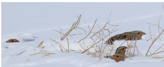
Grey partridge burrowing in snow

Slim pickings for sure, but nevertheless it was a wonderful birding day and a great way to pay tribute to those who fought and continue to fight for our freedom and keep us safe. Thank you for your service!