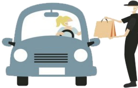
Curbside Pick up

Phone your order in and pay for it at least 30 minutes prior to arriving at The Wild Bird Store for pick up. Park in the curbside parking stall outside the phone us at (403)640-2632 when you arrive, pop your trunk or hatch and leave the rest to us.