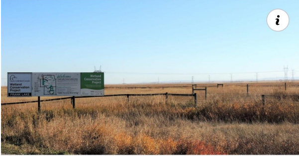
birdscanada.org Alberta's Frank Lake is an ideal spot for birds – not a solar farm | Birds Canada | Oiseaux Canada

Good day everyone. Here is a Blog by Birds Canada about Frank Lake IBA/ KBA. If you wish to show support in saving this area, please follow link to write the individual incharge of the approval process, Alberta Utiliti... See more