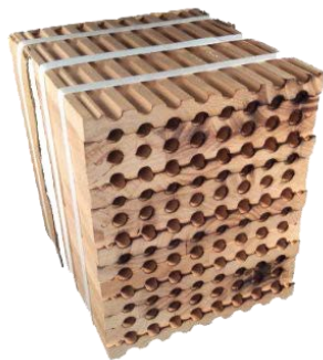
Mason bee stacking trays