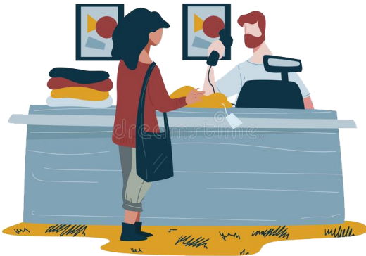
Shop in Store

In Store or on the Seed Truck, social distancing is encouraged.