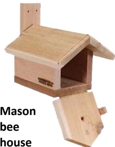
Mason bee house