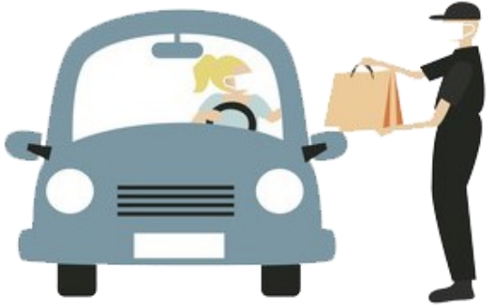
Curbside Pick up

Phone your order in and pay for it at least 30 minutes prior to arriving at The Wild Bird Store for pick up. Park in the curbside parking stall outside the phone us at (403)640-2632 when you arrive, pop your trunk or hatch and leave the rest to us.