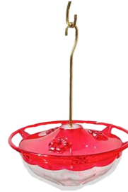
Hummingbird feeders recommended at The Wild Bird Store

The Humm-Bug: no nectar feeders attract hummingbirds by first attracting fruit flies. A favorite treat for the tiny fine-feathered friends. Simply open the two piece feeder, add 2 to 3 bananas and within a few days, hummingbirds will arrive to feast on the fruit flies.