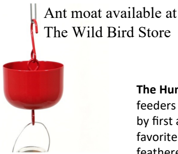
Ant moat available at The Wild Bird Store

RESPONSE: First of all, it does not matter to the ants (or the hummers for that matter) whether your sugar water is clear or red. But the first thing I would check is whether your feeder has any leakages. Dripping sweet water is a real attraction to ants. Sometimes the leakages are not obvious, especially if your feeder is located in the hot sun. Hot weather causes plastic to expand which can lead to leakages, so make sure your feeder is in the shade. I am not sure what kind of hummer feeder you are using, but some designs are better than others and less prone to leakage. You might also try hanging your feeder by a thin fishing line which is hard for ants to climb down upon. And some folks apply Vaseline or some other oily liquid on the line attached to the feeder. But be careful—you do not want your birds to get this on their feathers! And you do have to keep reapplying these substances to keep them effective. If you can find out how the ants are getting up to your feeder, you might be able to head them off at the pass and install commercial ant traps or even a water moat. If they are coming up a pole, for instance, you could tie some bay leaves or mint leaves around it near the base. Ants do not like either of these kinds of leaves. You could also try moving your feeder around to different locations to put the ants off. Above all, keep your feeder clean and free of any sticky sugar water on the outside.